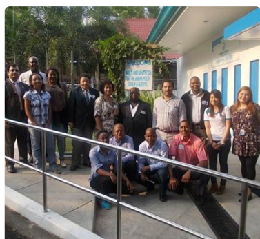
CRA and WSUP staff

An independent water regulator, Conselho de Regulação de Aguas (CRA), is also a key player at the national level. CRA sets service delivery standards and approves tariffs and water charges. CRA's annual report on service provision is seen as a powerful instrument for improving transparency and benchmarking delivery, and is widely shared with media and non-government organizations. At the time of writing, CRA does not have the authority to levy fines on providers who do not meet standards. Sanitation has traditionally not fallen under its purview, because no national-level agency or autonomous provider has been responsible for sanitation; furthermore, CRA's powers to regulate sanitation provision in Maputo are limited because the municipal government –which is formally responsible for sanitation provision– is perhaps sufficiently politically powerful to be "immune" to regulation. Since 2009, however, CRA has had responsibility for regulating sanitation, and it is currently developing a regulatory framework to be applied to the municipality. Furthermore, CRA is in the process of revising its statutory laws including powers of sanction and fines. CRA provides an annual audit of the water service providers in the country, and this audit is widely shared and used as a benchmark for service provision in the water sector; however, sanitation services are not currently covered in this audit.