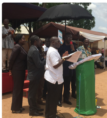
Ga West Municipal Chief Executive and Deputy Regional Minister for Greater Accra launch a new strategy promoting compound sanitation

sanitation services. The city does not monitor or regulate private-sector service providers, either, nor any aspect of the sanitation service delivery chain beyond CLTS. In light of the total privatization of these services, one might ask, what would Ga West Municipal Assembly spend its resources on doing?