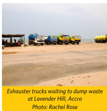
Exhauster trucks waiting to dump waste at Lavender Hill, Accra

Government: The ESP states that waste management is to be managed by the MMDAs through their respective Waste Management Departments and Environmental Health and Sanitation Departments. In Ga West, service provision is fully privatized and any municipally constructed public toilets are transferred to the private sector for operation and maintenance. The role of GWMA in sanitation service provision to the urban poor lies primarily with the promotion of sanitation, hygiene education programs, and monitoring of school and public toilets. The Public Works Department of GWMA handles new drainage investments, which serve as de facto household waste disposal facilities, but this department is not involved in the construction or maintenance of other pro-poor sanitation service facilities. Nationally, sanitation policy decisions fall under the Ministry of Local Government and Rural Development and Environment within the Environmental Health and Sanitation Directorate.