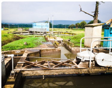
Wastewater treatment facility, Nakuru

infrastructure. Resources for capital expenditure come from a number of potential sources including the multi-donor Water Trust Fund, the County Office for Environment, Water and Natural Resources, and the Rift Valley Water Board.